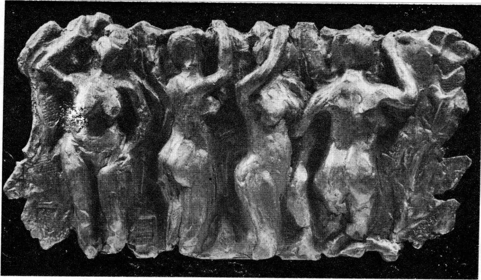
FRIEZE OF WOMEN